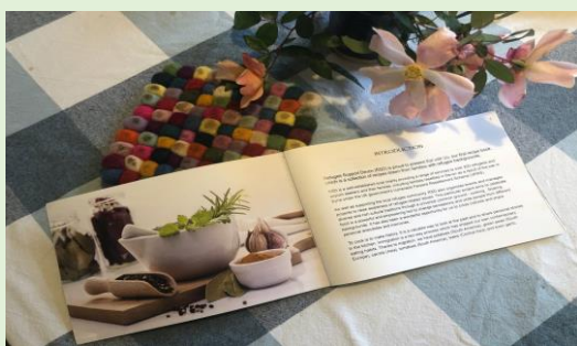
‘Eat With Us’