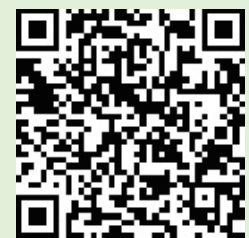
The 400 appeal